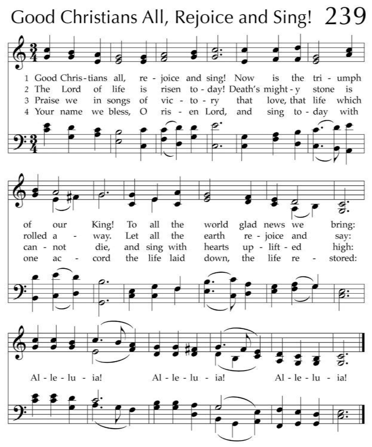
This 20th-century Easter text is both a song of encouragement (stanzas 1–3 directed to the congregation) and a song of praise (stanza 4 addressed to the risen Christ), all ending with joyous alleluias. It was written specifically for the dancelike 17th-century tune found here.